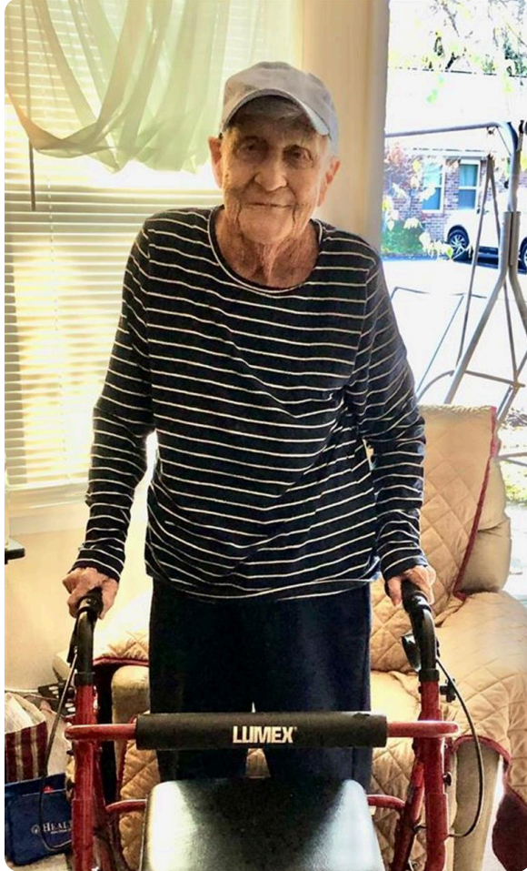
On the move.